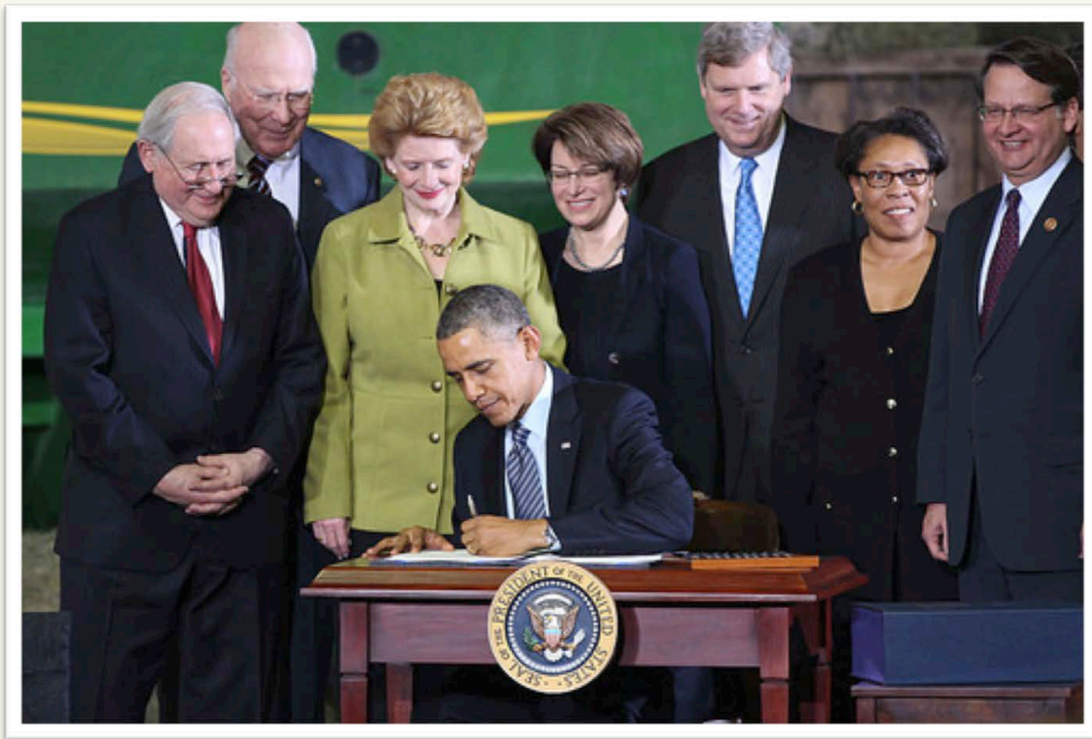
President Obama signs Farm Bill on Feb. 7